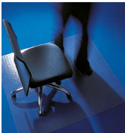
Ecogrip® Series 11 with anchor grips

Ecogrip® is made out of Makrolon®. This high-tech material is absolutely resistant against breakage and impact and offers an extremely long life of use. Additionally Makrolon® is entirely recyclable and thus contributes to an economical use of those raw-materials presenting the necessary resources for the production.