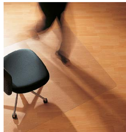
Ecogrip® Series 12 with antiglide layer

A thermally welded VAB® antiglide foil guarantees perfect adherence to hard flooring.