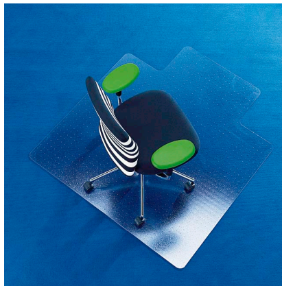
Roll-o-Grip® with anchor grips

Naturally, Roll-o-Grip® mats are completely odorless and non outgassing because they contain no PVC or vinyl. On our cristal-clear mats you can also, without any hesitation, watch your children safely frolic upon them.