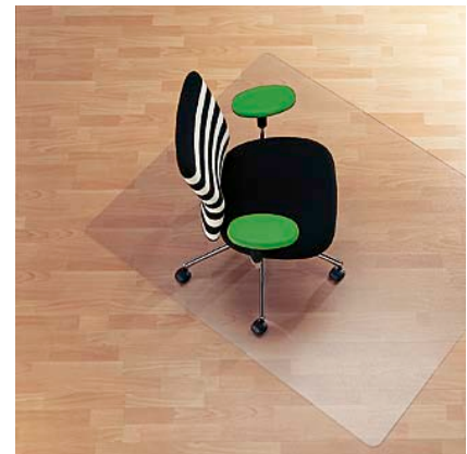
Roll-o-Grip® with antislip layer

For softer flooring such as carpet, we recommend this type of mat since thousand of small anchor grips keep your mat in place without damaging the flooring material. The anchor grips are suitable for high carpets. Thickness: 1,8 mm, Length: 4,5 mm.