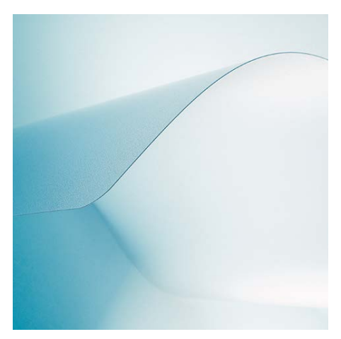
For hard floors with VAB®-antiglide layer