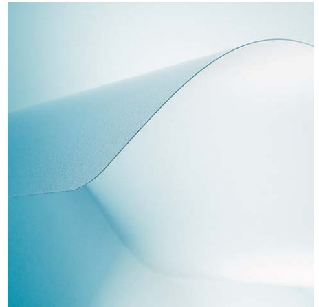
For hard floors with VAB®-antiglide layer