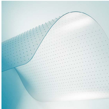
For carpets with anchor grips